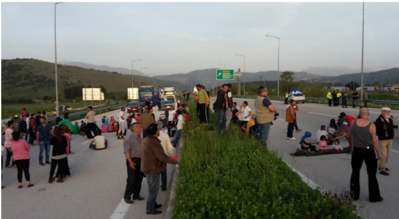
Abbildung 3: Blocked Highway, Photo: Moving Europe