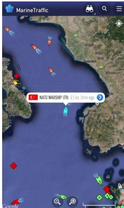
Abbildung 1:

At the moment only few people make it from Turkey to the Greek islands. The Turkish coastguard intercepts boats with the help of Frontex and 5 Nato vessels and forces them to go back to Turkey. See e.g. here :