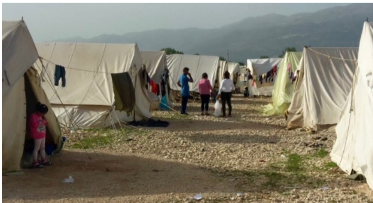
Abbildung 2: Camp in Katsikas, Photo: Moving Europe

The repeated insistence from officials and media that people should leave Idomeni and go to 'better' official camps neglects two realities: one, that official camps are not "better" and two, that there is far from enough space in these official camps. According to the data from the UNHCR, there are only places for 30'860 people in the official camps on the Greek mainland. However, there are 46'450 people stuck on the Greek mainland (source UNHCR, 17th of April 2016).