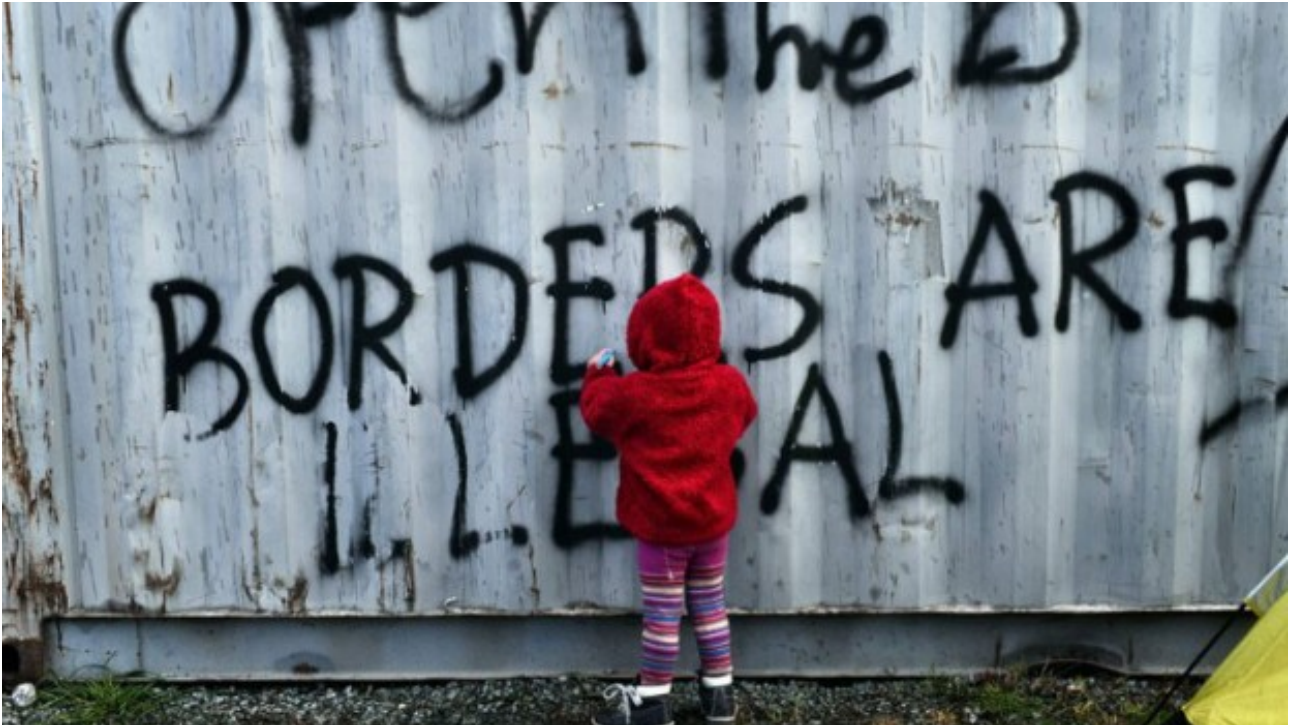
Abbildung 5:

trying to deprive them from their freedom of movement. Nevertheless, people currently stuck in Greece will not forget the struggles of their families and friends who made the Balkan corridor possible last summer. Closed borders and barbed wire fences cannot stop migration movements.